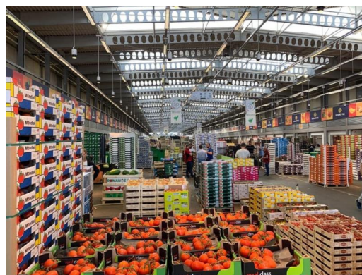
The world famous Rungis market in Paris

In Berlin, we went to see Kadewe, the second largest department store behind Harrods. They had a good selection of gourmet food in their food hall section. However, the highlight of the trip had to be the trip to the world famous Rungis market in Paris. It was way bigger than 10 halls of Singapore Expo combined and it would be best to drive around to the different halls if you want to cover as much as we did. You can find all sorts of produce and top quality ones, mostly from France, but from the rest of the world as well. It