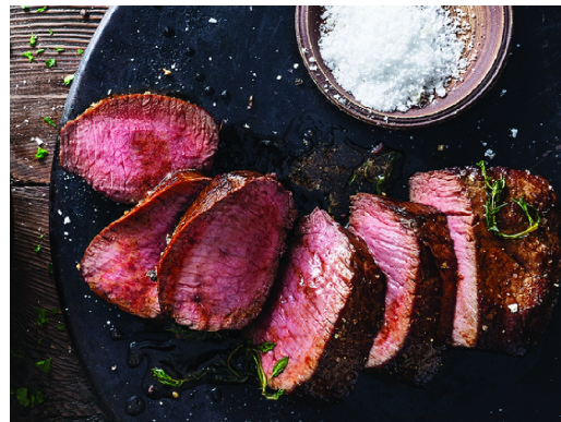
Grass-fed wagyu (left) and Venison short loin (right)

Personally, I am trying to eat more grass-fed beef but often grass-fed beef can be a little tough or dry. Thankfully, there is now grass-fed wagyu to help overcome that problem. The cattle graze on prime grasslands where the land cost is much higher than grain-feeding